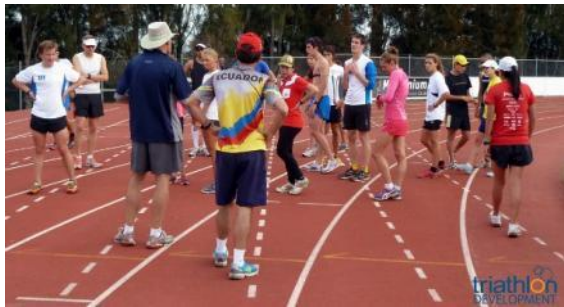
Young triathletes at the training camp

The IJF awarded the 8 th dan, one of the highest grades in judo, to Russian President Vladimir Putin, who was celebrating his 60 th birthday on 7 October. Putin is an Honorary President of the IJF and an emeritus and recognised judoka.